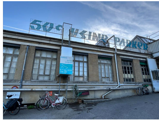
The final Consortium Meeting was held in Geneva, Switzerland September 25-28.